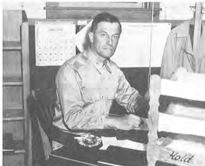
A very youthful General Bolte.