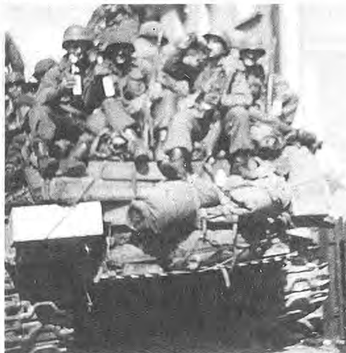
Men enjoying cognac on the tanks.

Company C, 271st Infantry captured Torgau on the Elbe River. There we waited for about ten days for the Russians to meet us. The Russians had to cross the river to our side.