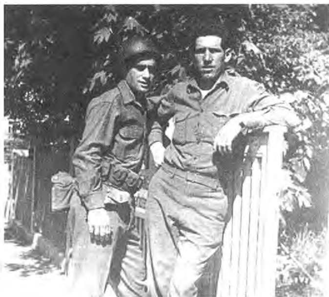
I am the soldier on the left.

I was drafted into the Army in September of 1944, and was sent to Fort Dix, New Jersey for ten days. From there I was sent to Camp Croft, South Carolina. After thirteen weeks of training, I had ten days of leave. After my leave, I then had to report back to Fort Dix. Some days later, we were leaving for New York to board the SS America going to England. From England we went on to a smaller English ship to France.