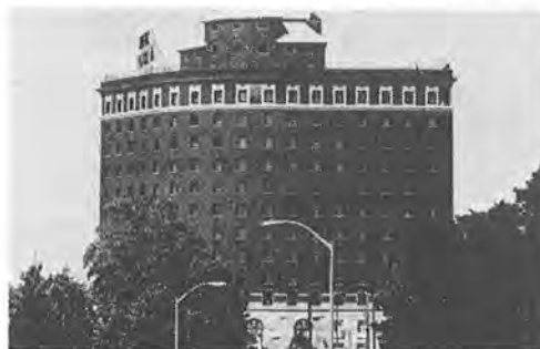
Close-up view of the Niagara Hotel where the 69th Divisions's 40th Annual Reunion will be held.

Attractions Nearby: Within walking distance: Niagara Falls, Maid of the Mist Boat, Native American Center, Aquarium, Rainbow Bridge to Canada, Indoor Shopping Mall, Cave of the Winds, Wintergarden.