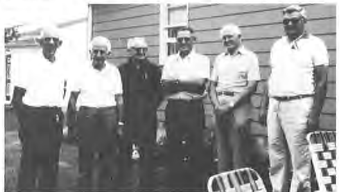
Members of the construction section of the 569th Signal Company meet in Hubbard, Ohio.