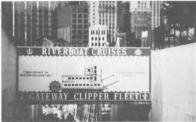
Entrance to the river boat dock downtown Pittsburgh in the background.