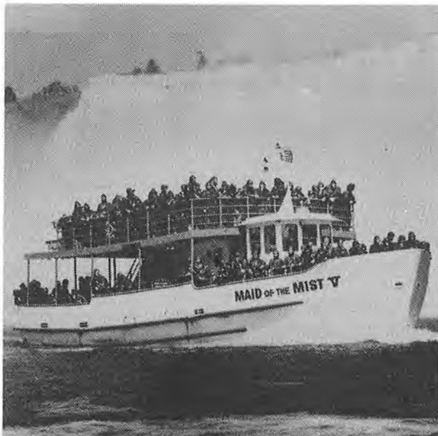
Maid of the Mist