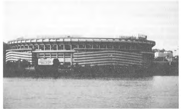
Three Rivers Stadium, Pittsburgh, Pennsylvania