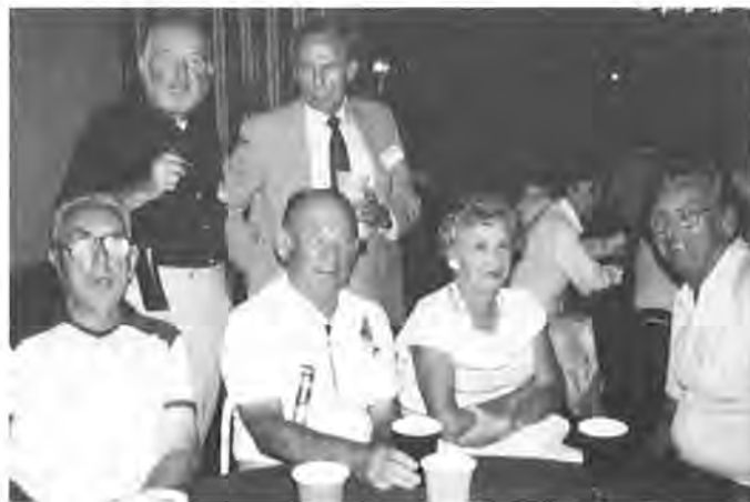
Div. Hq. & Hq. Company men at the Pittsburgh Reunion in 1986.