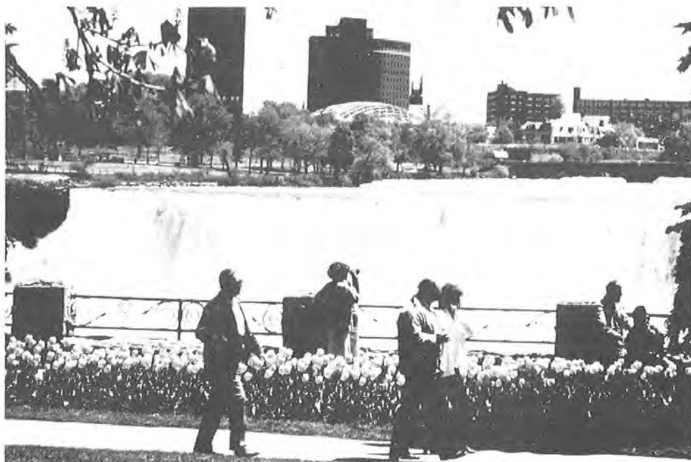
This is a view of the American Falls from Canada and the building in the center background with the silver domes on top is the Hotel Niagara.