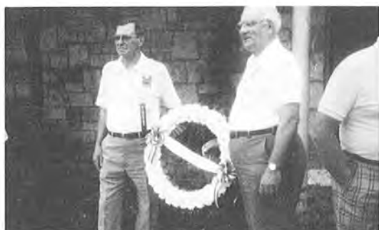
— — Memorial Service, Pgh.