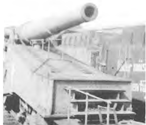
Railroad Gun in Germany