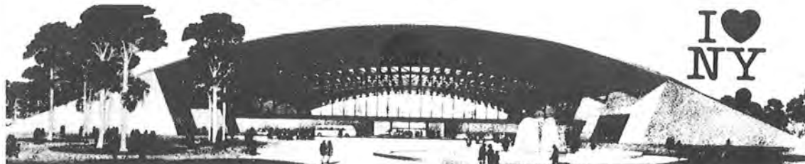
CONVENTION AND CIVIC CENTER WHERE BANQUET WILL BE HELD.

Attractions Nearby: Within walking distance: Niagara Falls, Maid of the Mist Boat, Native American Center, Aquarium, Rainbow Bridge to Canada, Indoor Shopping Mall, Cave of the Winds, Wintergarden.