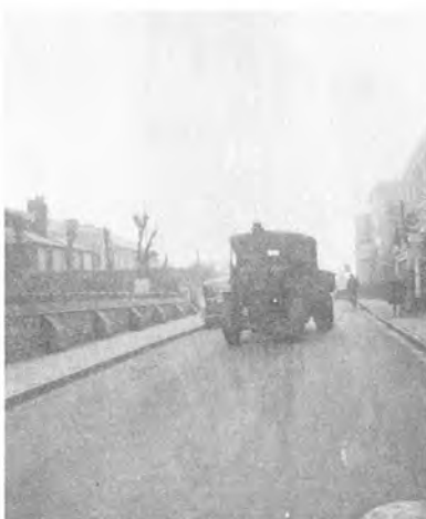
Coke burning vehicle in Winchester, England.