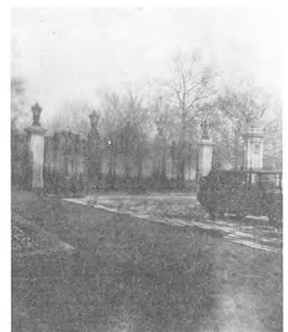
English Taxi in London