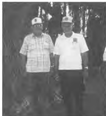
The same two gentlemen pose in the same position at the Williamsburg, Virginia Reunion in August of 1985.