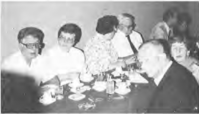
St. Clairsville, Ohio, September 28, 1985