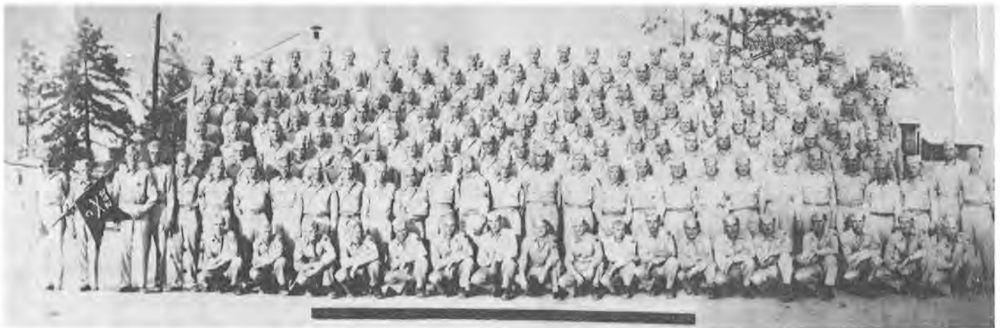
Company C — 272nd Infantry Camp Shelby Mississippi — August 1943