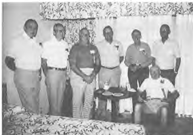
Former members of Div. Hq. Co. at the 1985 Williamsburg Reunion.