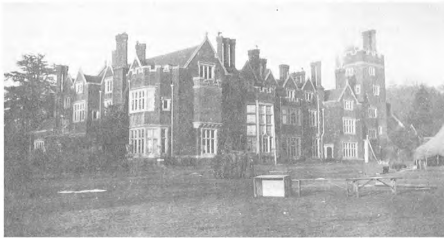
Longwood Castle in England where AT-271st and the Mine Platoon were quartered.