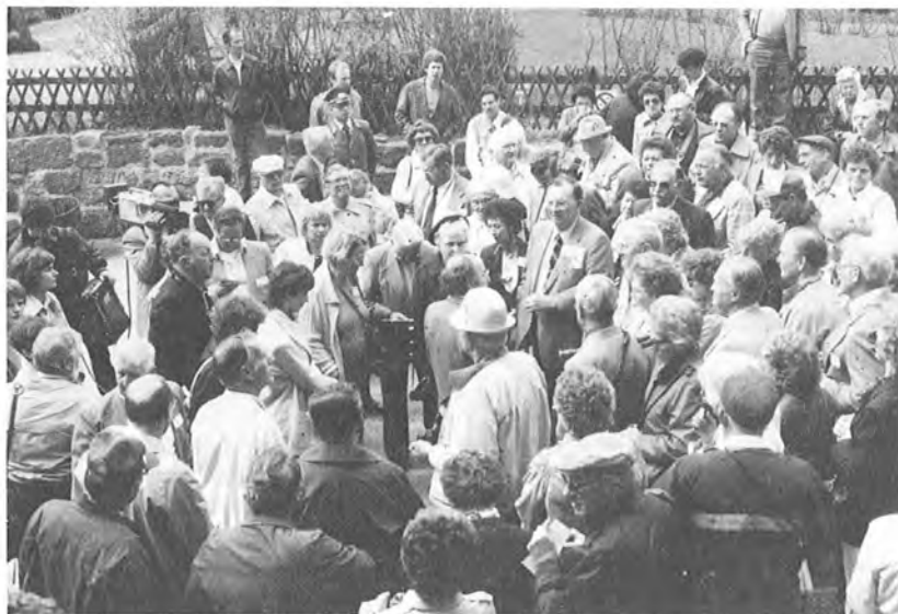
Members of tour group at Wartburg Castle, Eisenach, East Germany.