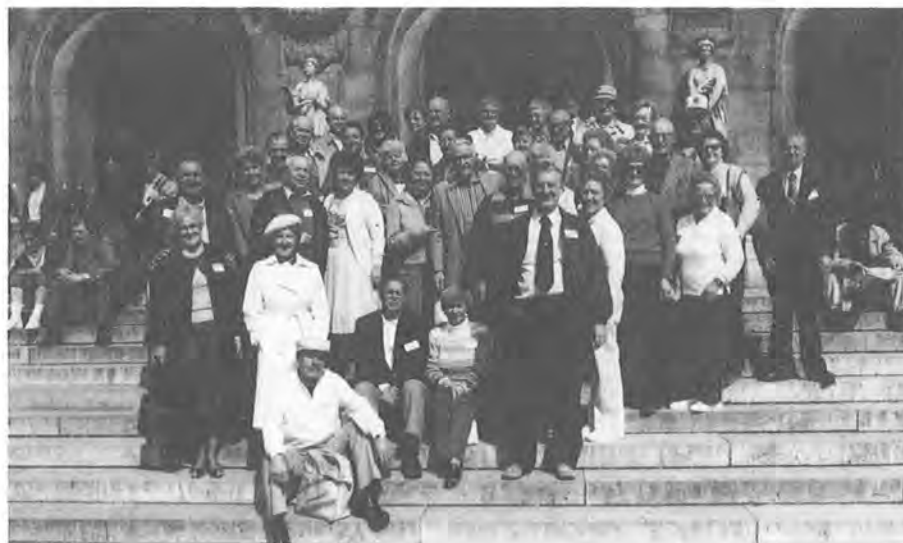
Part of the 69th Tour Group in front of the Opera House in Paris, France.

See you in Colonial Williamsburg at the 38th Reunion. August 18th to 25th, 1985