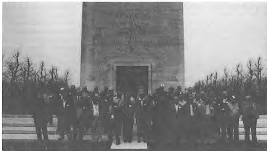
Former members of the 69th Infantry Division standing in front of the Memorial at Netherlands American Cemetery in Margraten, Holland.