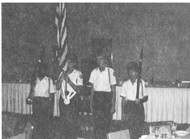
R.O.T.C. Color Guard for Memorial Service.