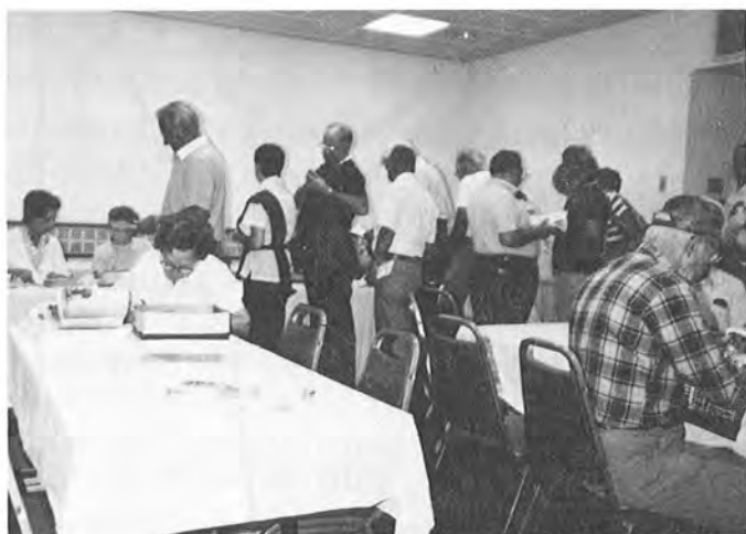
Early Arrivals signing up in the registration room.