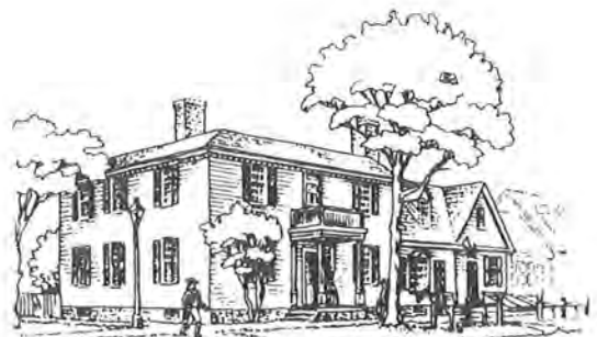
James Geddy House