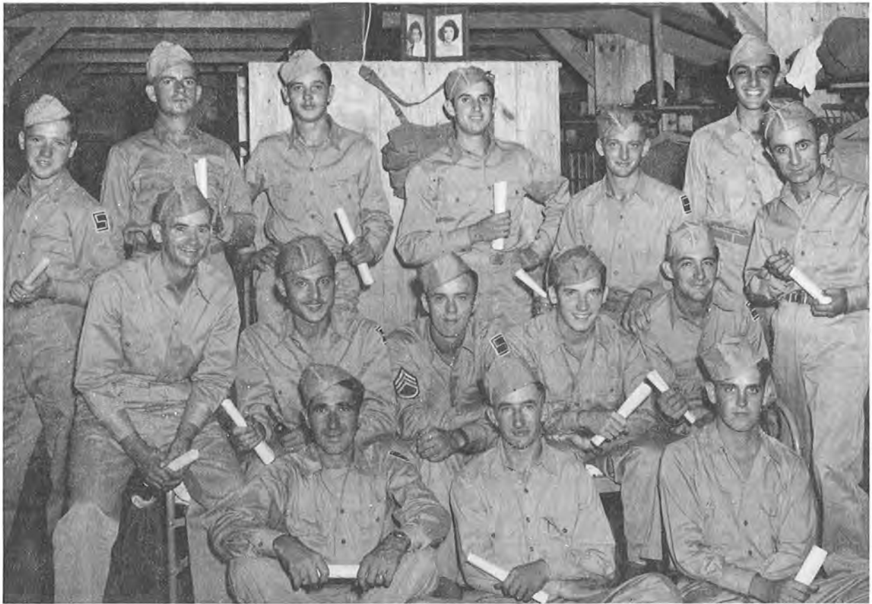
569th Signal Company Message Center. The Hut #2 boys at Camp Shelby.