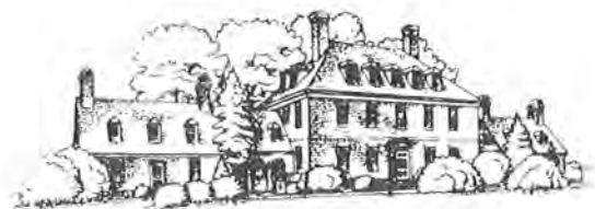
Carter's Grove Plantation