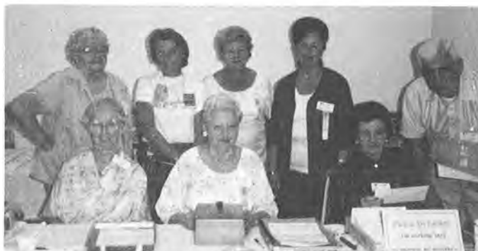
This dedicated group capably handled the Registration Desk for our Annual Reunion in Orlando, Florida in 1984.