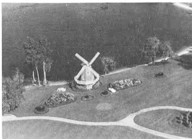
A view of part of beautiful Cypress Gardens.