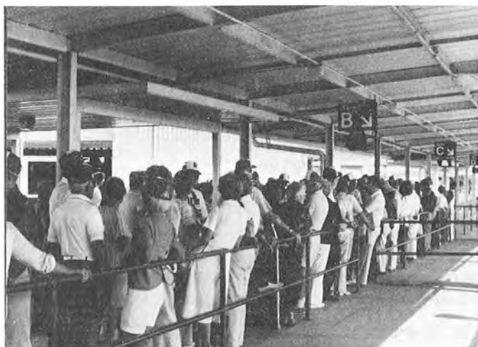
"Just like the Army," Waiting in line for tour of Kennedy Space Center.