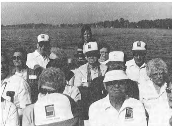
Boat Cruise at Cypress Gardens.