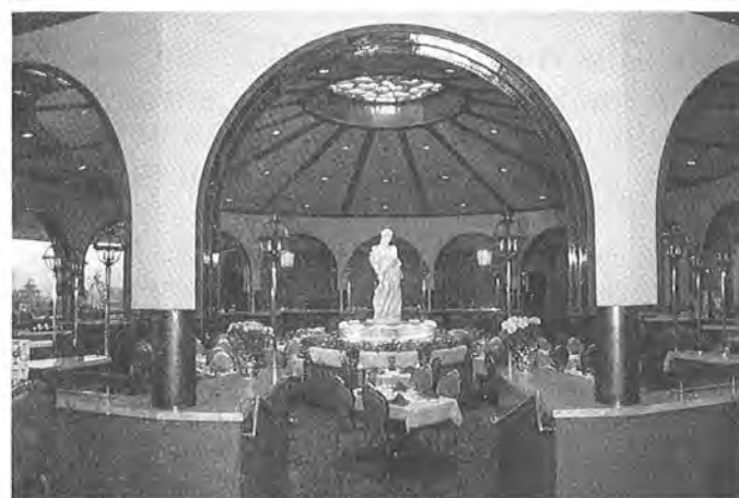
Dining Room of the Tangier's Restaurant in Akron, Ohio where the Thursday afternoon buffet will be held for Tri-State meeting in June.