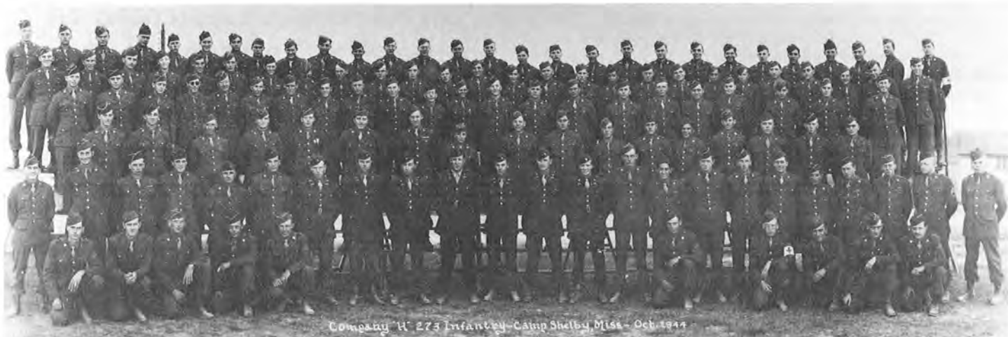
Company "H", 273rd Infantry Camp Shelby, Mississippi — October 1944