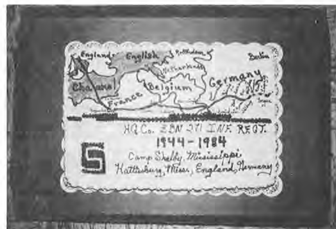
40th Anniversary Cake baked for the occasion.