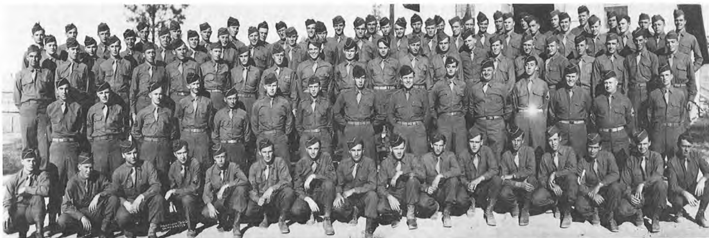
Headquarters Company, 273rd Infantry Camp Shelby, Mississippi — October 1944