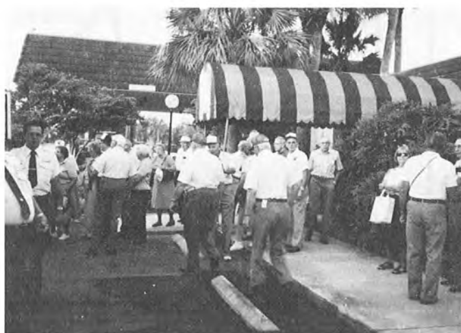
Rushing to board the bus for one of the tours.