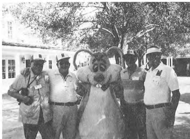
This group of 69er's met a Happy Friend at Cypress Gardens.