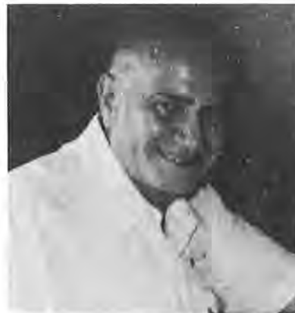
August 1983. Battery A-881st Field Artillery